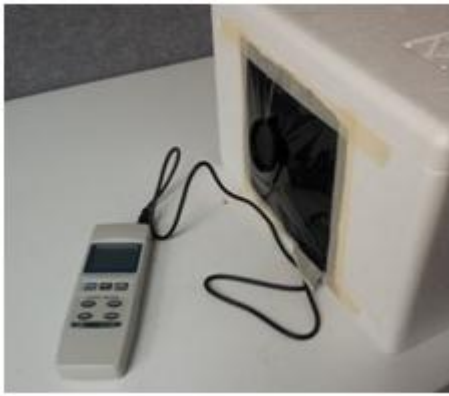
Figure 1: LX-1108 Fitted to Sealed Container

8) 400ml of distilled water was poured into the beaker and its conductivity was tested using the EC-PCTestr35 , the result was then recorded for future reference.