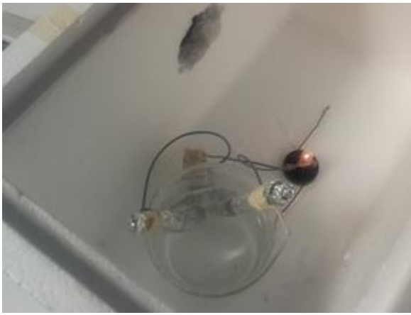
Figure 2: Beaker, battery, electrodes and globe setup for measurement

9) The beaker, battery and light globe along with the electrodes were setup in the foam box and the circuit tested to see if the globe lit. The lid was then fitted to the foam box and a lux level was taken.